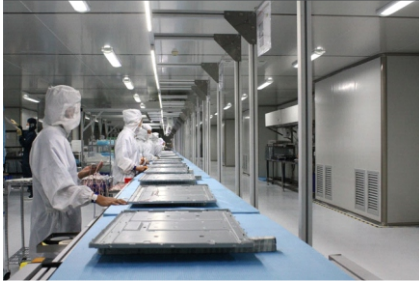
Module production line