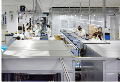
Commercial display product assembly line