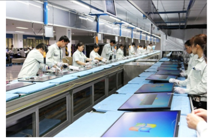
Professional display product assembly line